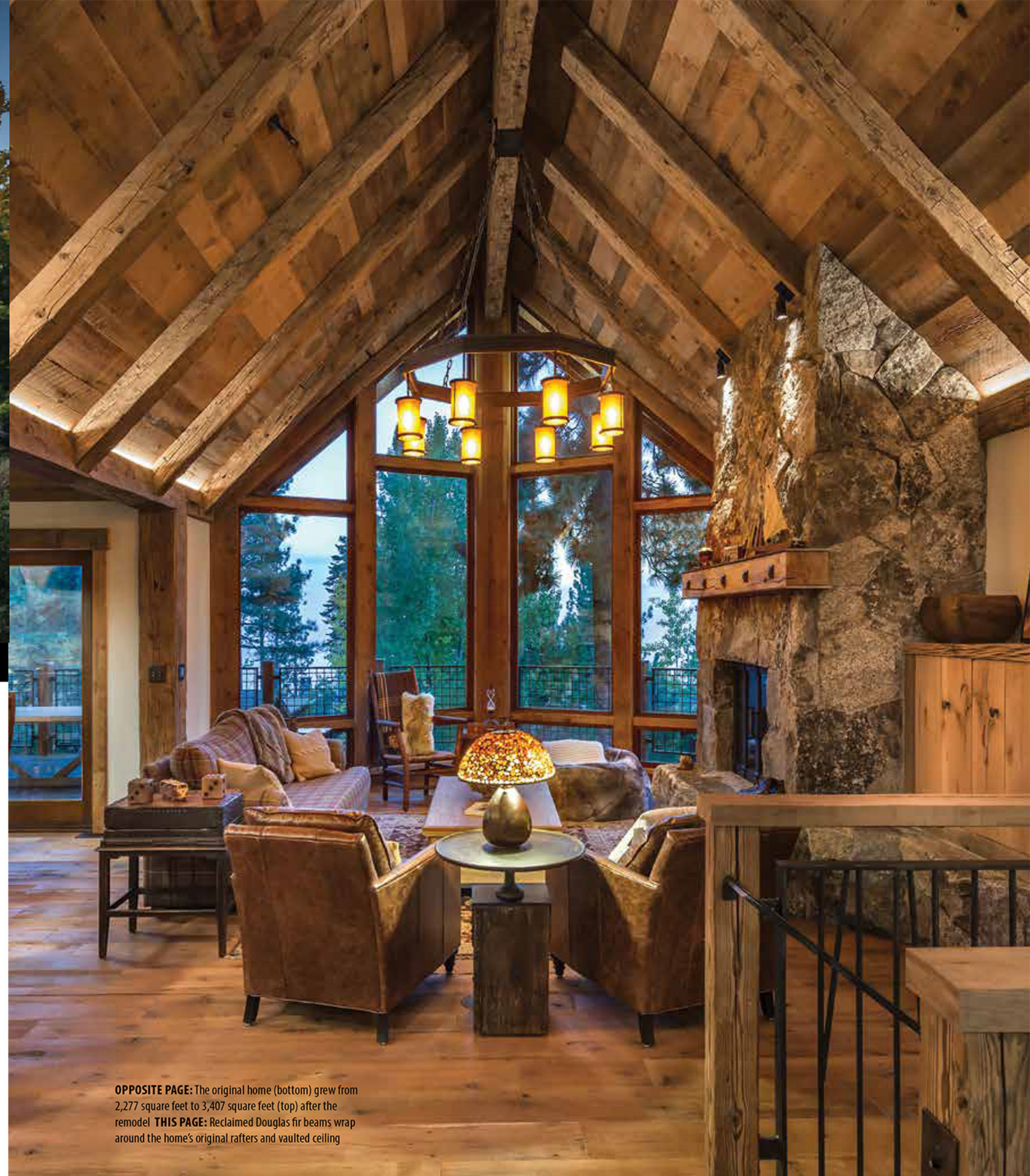
OPPOSITE PAGE: The original home (bottom) grew from 2,277 square feet to 3,407 square feet (top) after the remodel THIS PAGE: Reclaimed Douglas fir beams wrap around the home's original rafters and vaulted ceiling

Behind the expertise of Tahoe City's Welling Construction and Wittels Engineering, along with Truckee's Aspen Leaf Interiors and Finishing Touch Carpentry out of Tahoe City, the couple achieved their vision, transforming the home from a 1970s chalet into a mountain lodge with a modern take on rustic appeal.