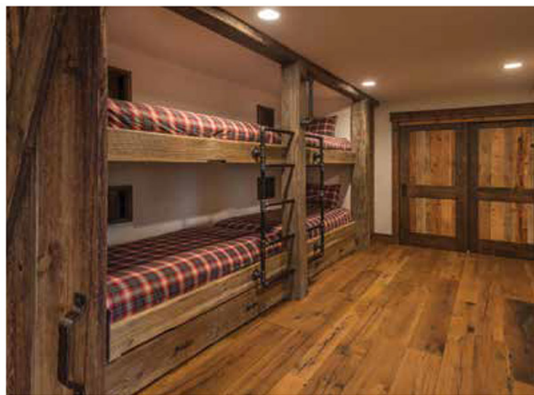
THIS PAGE, CLOCKWISE FROM TOP: The front door is built of solid cypress cedar wood and includes an embedded peek-a-boo window | The master bathroom continues the home's rustic theme | A bunk bed suite on the lower floor OPPOSITE PAGE: The rustic-themed kitchen includes an island with a sandalwood granite countertop

Beyond the great room's fireplace, floor-to-ceiling windows look out to an expansive new deck that towers over the steep-sloping lot, with views below to a particularly shimmering, sunlit portion of Tahoe's North Shore. The deck is constructed of Alaskan yellow cedar, wire-brushed for an aging look, while a circular cedar hot tub was custom built into the corner of the deck. The hot tub overlooks The Lake on one side and is sheltered on the other by a privacy screen built of mesh with inlaid copper panels. A trellis overhead