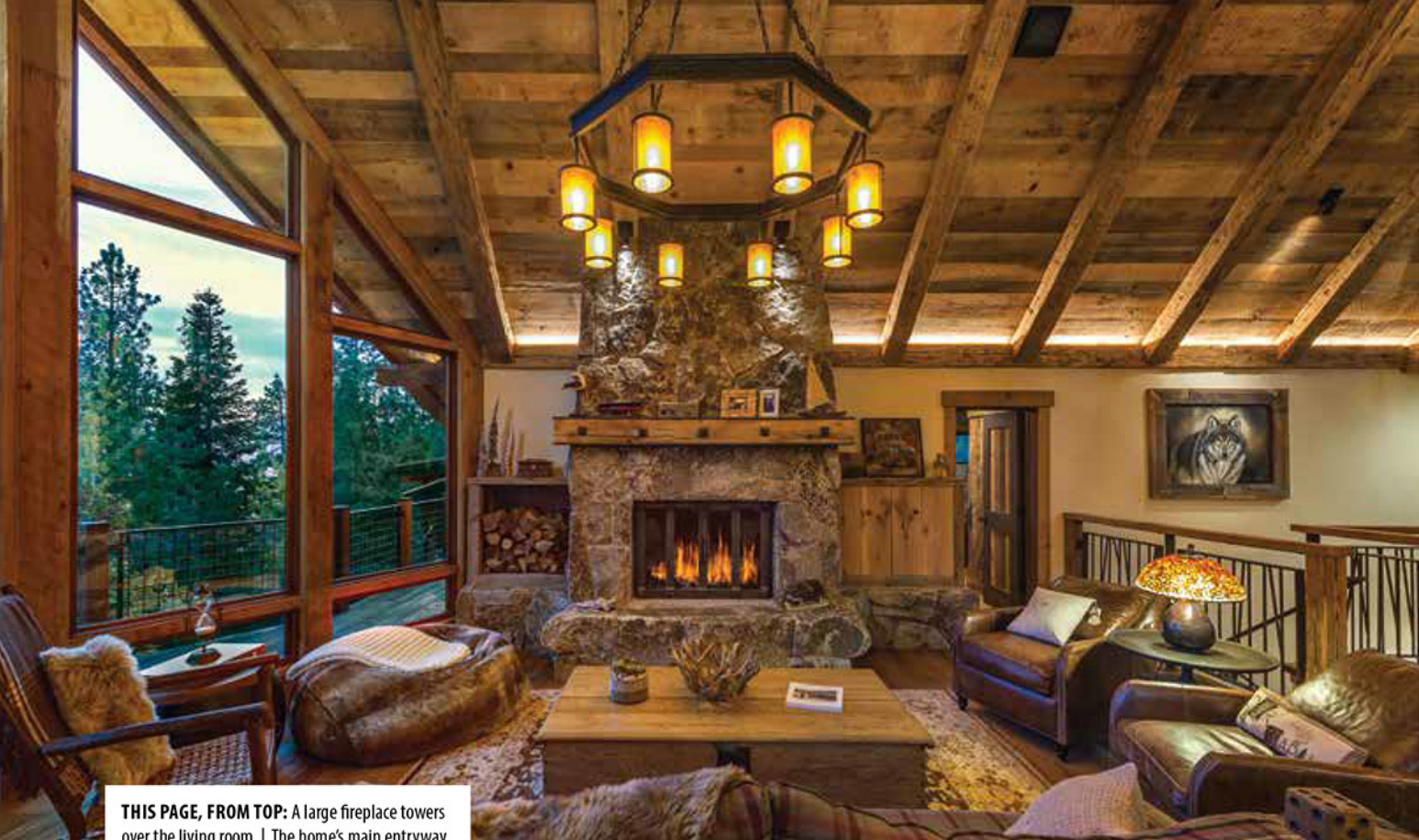
THIS PAGE, FROM TOP: A large fireplace towers over the living room | The home's main entryway

includes lights and speakers, and an outdoor shower with a quartz slab underfoot is conveniently located nearby.